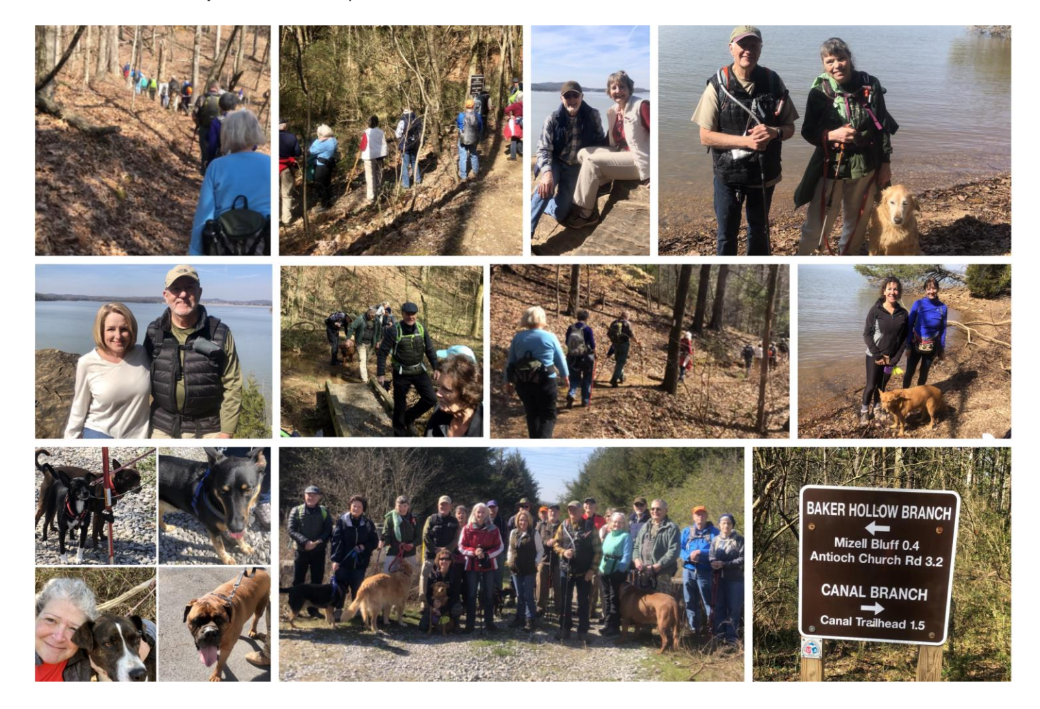
FEBRUARY 21, 2020 BENTON MACKAYE TRAIL SECTION BIG BEND TO TOWEE CREEK Canceled due to weather.

Afterwards several of us ate pizza or calzones at Pizzeria Venti. The next two hikes on the East Lakeshore Trail are scheduled for Monday March 30 and April 13.